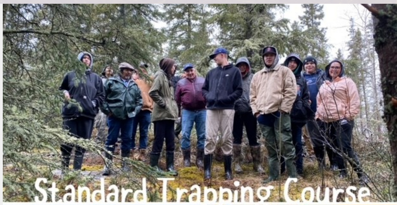
Standard Trapping Course

All funds raised will support the Westlock Rotary Club with upgrades to the Westlock Rotary Trail